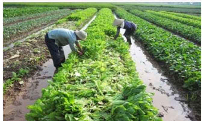
Clean vegetable field at Moc Chau under the project “Development of the safe vegetable value chain in the North of Vietnam”

After 3 years implementation, the project has created the linkage between the small safe vegetable production holders and the modern distribution channel which greater the added value for agricultural products and provide safe vegetables for consumers on the northern area of Vietnam. Via the direct linkage between the small production holders and the modern distribution channel, Metro expect to enhance the values of agricultural products, create stable outputs for farm-householders and decrease the adverse impacts to the environment in the production