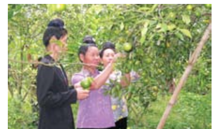
Farmers at Thanh Chan Commune are studying the techniques to mix Vinh orange with guava.