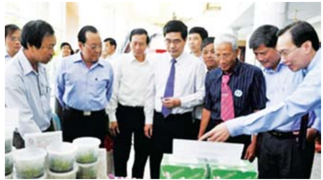
HCMC Party Secretary Le Thanh Hai and Minister of Agriculture and Rural Development Cao Duc Phat are reviewing the agricultural products of the farmers in NRD targeted Communes

A t the meeting on the direction for the National Target Program on New Rural Development (NTP-NRD) under the Ministry of Agriculture and Rural Development (MARD) on April 16th 2013, Minister Cao Duc Phat said that related departments should be fully aware of the contents and responsibilities for NTP-NRD, at the same time, should be serious and active in the implementation of assigned tasks. (Detailed contents are in the Announcement No.1905/TB-BNN-VP dated April 16th 2013.