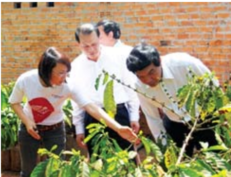
Deputy Prime Minister Vu Van Ninh is visiting the coffee sustainable development model of Ea Tul Commune, Dak Lak

provincial, district and commune levels. In the current implementation, leadership and direction must be very practical. Impatience for the early targets should be avoided. The Deputy Prime Minister emphasized the need of regularly review and reconsideration of the planning, even when it was approved, because this programme was very important, especially in production planning, land use planning associated with the production planning. The Deputy Prime Minister said that planning must come from the conditions of the localities. The communes have to provide specific requirements while the