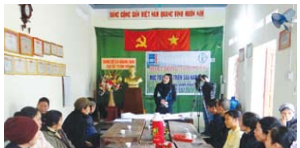
FAO consultation with poor and landless farmers/people on development goals after 2015 in Vinh Phuc, Quang Nam

UN General Secretary has launched national consultation workshops and public approach on post-2015 activities. With its impressive achievements gained in meeting the MDGs, Vietnam is selected by the UN to organize consultations to listen to the voice of people about development goals after 2015.