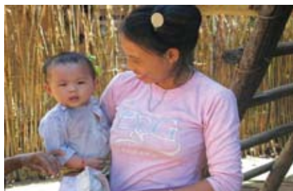
Rural women play an important role in the prosperity and happiness of families, communities and the whole economy