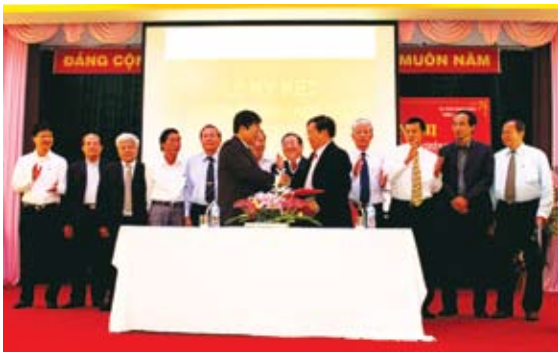
Signing Ceremony on the Cooperation programme in 2013-2015 between Vietnam Association of Science and Rural Development and DCRD on 15th March 2013.

I n the cooperation program between Vietnam Association of Science and Rural Development and the MARD approved on 20 May 2012, the Minister Cao Duc Phat assigned the Department of Cooperatives and Rural Development (DCRD) to collaborate with the Vietnam Association of Science and Rural Development to implement the activities related to RD (Announcement No. 6404/TB-BNN-VP dated 24 Dec 2012). The two sides committed